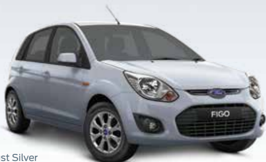
Moondust Silver (Metallic*)