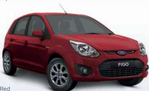
Paprika Red (Solid)