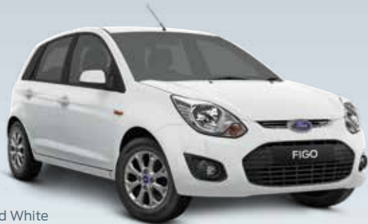
Diamond White (Solid)

Choosing the colour of your FIGO is an opportunity to make it yours. The quality cloth trims and stylish wheels will ensure your FIGO looks good, all-round.