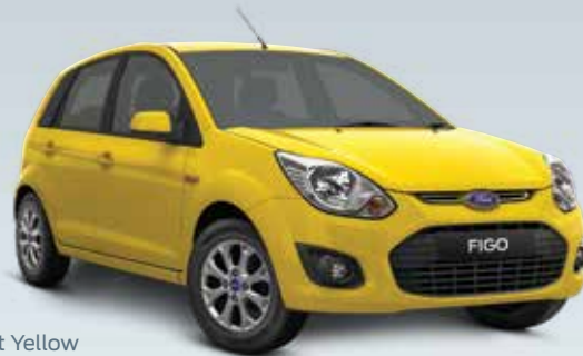
Bright Yellow (Metallic*)