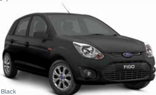
Panther Black (Metallic*)