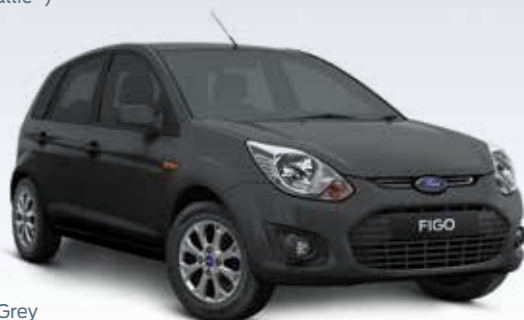
Sea Grey (Metallic*)