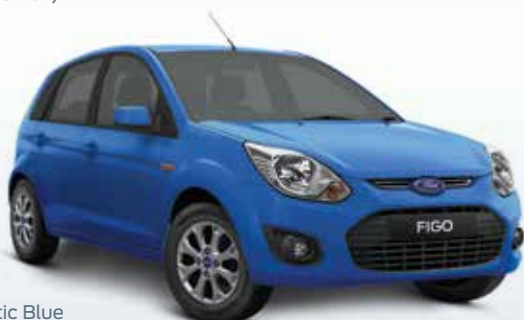
Kinetic Blue (Metallic*)

*Metallic body colours are options at extra costs.